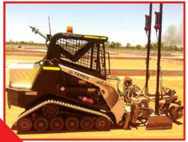
Small Terex PT30 with automated 3D laser system for tight access and pipelines 1240 wide or 1560 wide