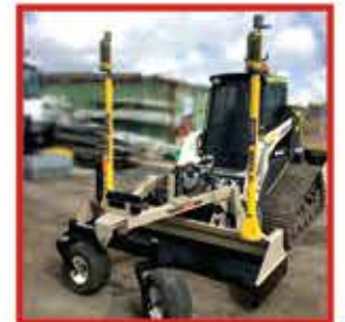
Large Terex PT80 with 3D automated laser grading system (2.2m wide) accuracy 2 to 5ml