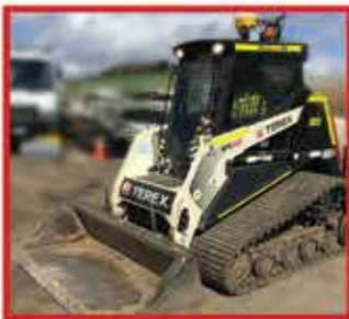
Large Terex PT80 with 20 GP bucket on GPS (2.2m wide) accuracy 20 to 40ml