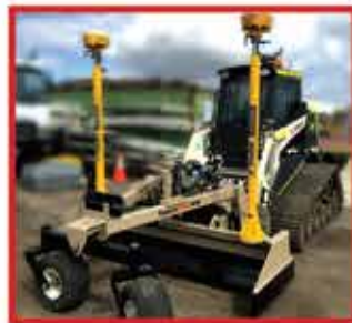
Large Terex PT80 with 3D automated GPS grading system (2.2m wide) accuracy 15 to 20ml