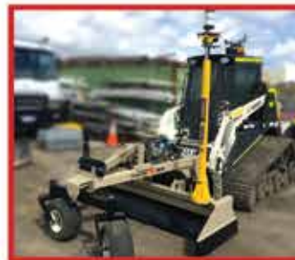
Large Terex PT80 with 3D automated TPS grading system (2.2m wide) accuracy 5 to 10ml